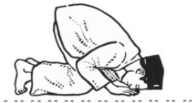
Fig. 8 – The second sajda

“All prayer and worship, rendered through words, actions, and good deeds, are due to Allah. Peace be to you, O my Prophet, and the mercy of Allah and His blessings may be showered upon you. Peace be to us [to those attending this prayer] and to the righteous servants of Allah. I confess that there is no deity but Allah and that Muhammad is His servant and His Apostle.” [Translation].