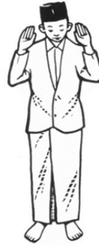
Fig. 2. The takbirât el-ibrâm posture

1- Then follow the words of “ takbirât-el-ibrâm “: Allahu Akbar “Allah is Greater”, uttered with the thumbs touching the lobules of the ears and the open hands on each side of the face, as shown in [Fig. 2].