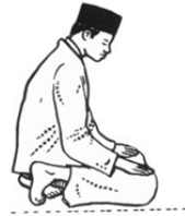
Fig. 7. – The first jalsa

“ At-tabiyātu lillābi, wassala-wātu wattayibātu, Assalāmu ‘alayka ayyuhan-nabiyu wa rahmatullābi wa barakātuh. Assalāmu ‘alaynā wa ‘ald ‘ibādillābis-sālibîn. Ash-badu an-lâ Ilâha-illAllahu wa ash-badu anna Mohammedan-’abduhu wa Rasûlub. ” [Transliteration]