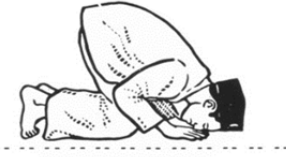
Fig. 6 – The first sajda