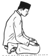
Fig. 9– Tabiyât and Tashabbud posture.

9- If the worshipper intends to perform more than two ral’âts , he then stands up, but if he has to say prayer only for two rakâts , he repeats also the following prayer of blessings for the Prophet: - “ Allahumma sallî ‘alâ Muhammad wa ‘alâ âli Muhammad