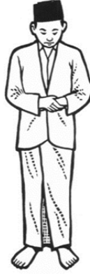
Fig. 3. – Qiyâm position

“Glory to You O Allah and Yours is the praise and blessed is Your name and exalted is Your majesty; there is no deity to be worshipped but You. I seek Allah’s protection against the cursed Satan” [temptation]. [Translation]