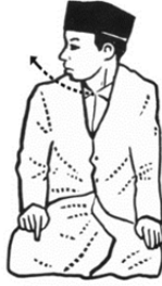
Fig. 10 – First salâm

“ Assaâlmû ‘alaygom wa rahmatul-lâbi wa barakâtub. ” [Transliteration] “Peace and mercy of Allah be upon you”. [Translation]